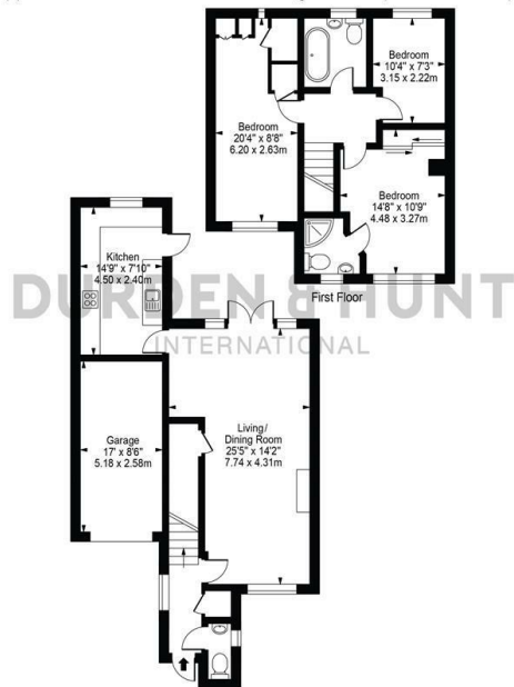
Ground Floor For Illustration Purposes Only - Not To Scale

Colwall Gardens Approx. Total Internal Area 1231 Sq Ft - 114.36 Sq M (Including Garage) Approx. Gross Internal Area Of Garage 144 Sq Ft - 13.36 Sq M